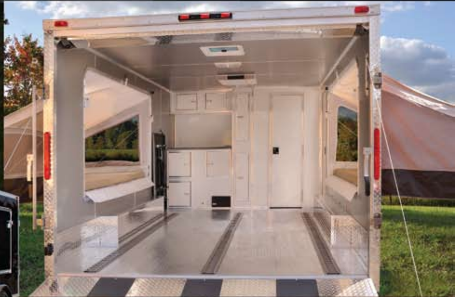
Model QSVRV8.5X16 w/Living Quarters.

THIS 8.5 x 16 MODEL WITH LIVING QUARTERS AND TWO TIPS OUTS WEIGHS ONLY 2,500 lbs!