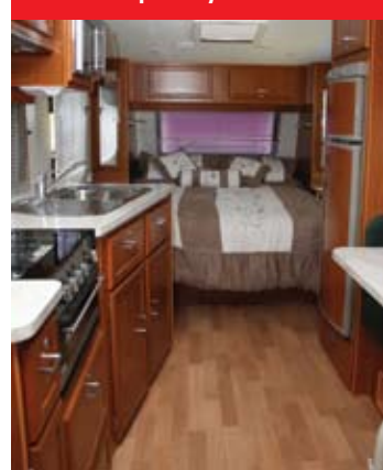
Nice and open layout