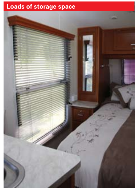
Loads of storage space