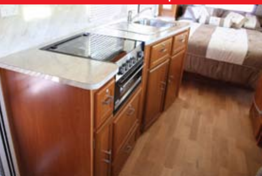
Glass cover over the cooktop

The dinette has plenty of space for four to dine in comfort or play cards etc. Forward of the dinette is the fridge/freezer console. There is ample storage above and beneath the lounge.