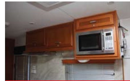
The microwave is fitted above the sink