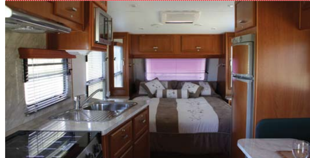
The interior finish of the Windeyer is very tidy