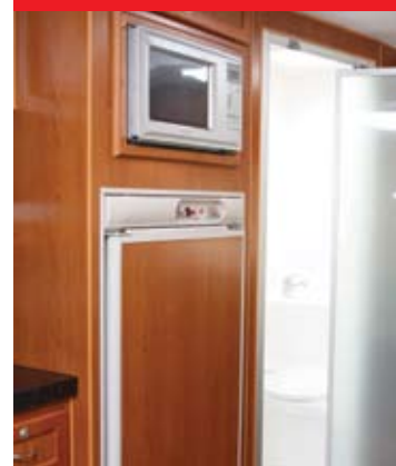
The fridge/microwave console