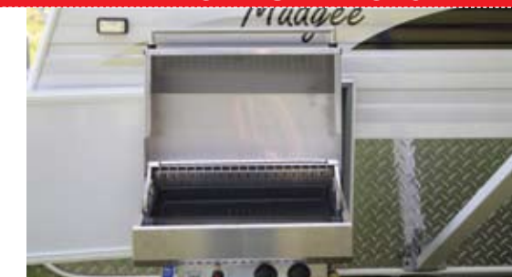
Slide-out BBQ positioned up forward