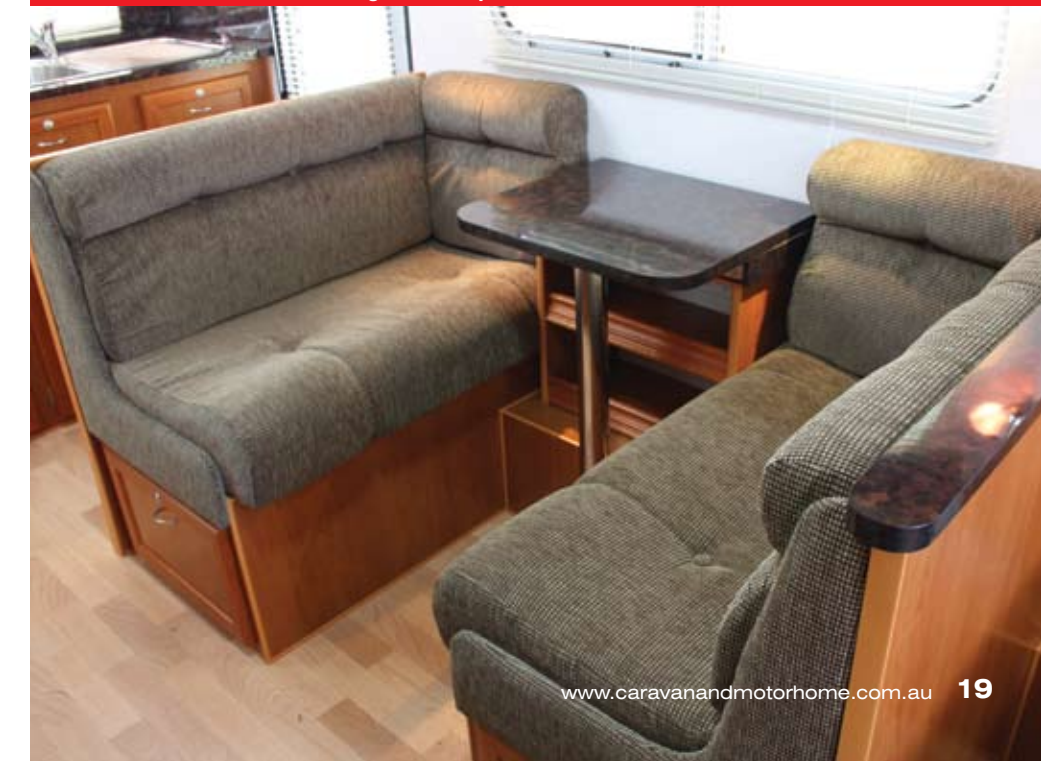
The tri-fold table makes the lounge/dinette practical

The kitchen is stylish and practical, with a stainless steel sink and four-burner cooktop (three gas and one electric) and grill in the benchtop. A benchtop cover is fitted over the cooktop to add to available bench space. There are plenty of storage cupboards, drawers and lockers fitted.