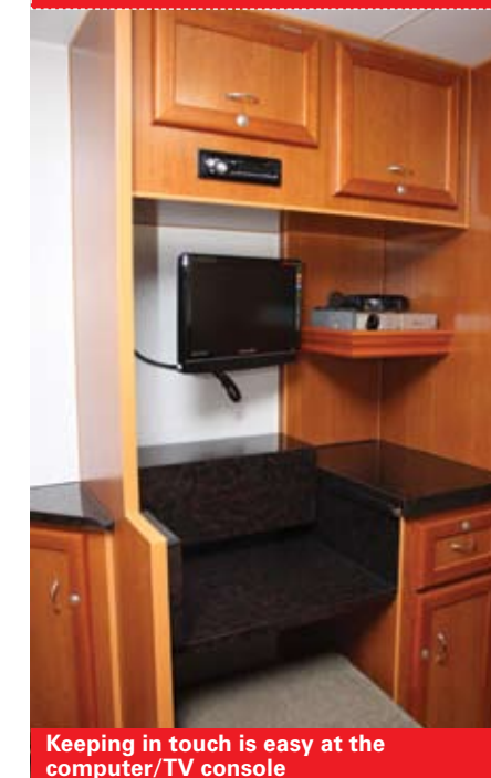
Keeping in touch is easy at the computer/TV console