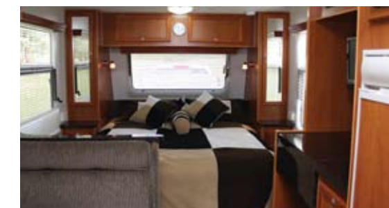
Clean, open, modern interior

Protective chequerplate is fitted along the flanks. At the rear is a solid bumper carrying a spare wheel and capable of supporting such things as jerry cans and bike racks. The rear lights are easily visible and mounted in a chequerplate panel.