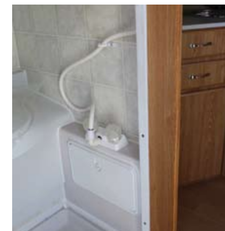
The shower/toilet is compact yet practical

A large roof hatch is fitted, along with a wind-out awning, external light and external shower.