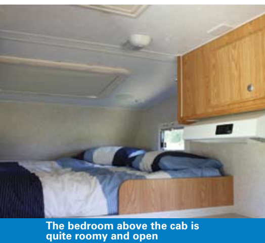
The bedroom above the cab is quite roomy and open

The Northstar Nomad is a hardwall camper, with insulated fibreglass wall panels and strong roof where solar panels can be mounted.