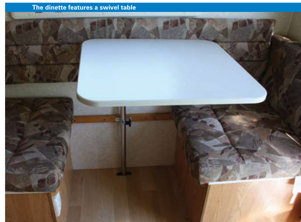
The dinette features a swivel table