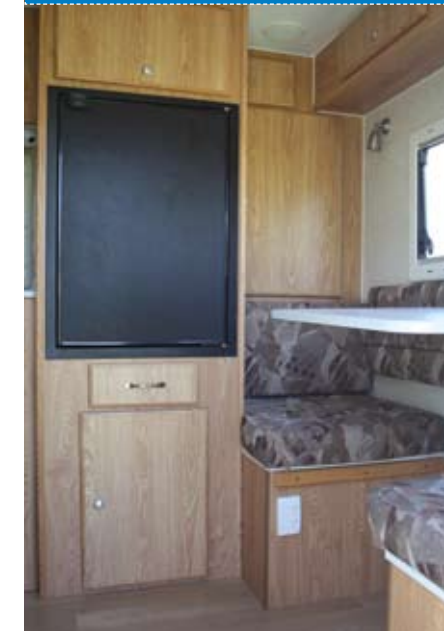
The fridge is raised for easy access