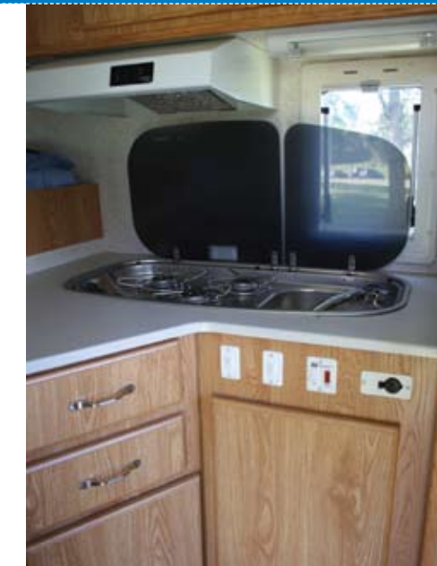
The angled kitchen is very practical